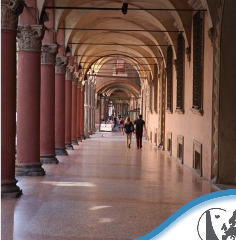
Entrance of Palazzo Hercolani and interior of Boschereccia Dining Room

9 - 13 September 2024 | Palazzo Hercolani | Bologna (Italy)