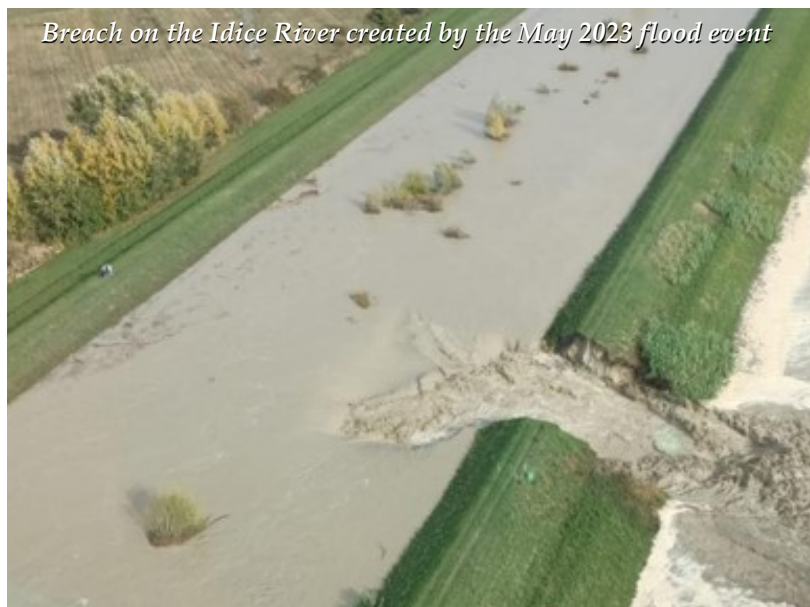
Breach on the Idice River created by the May 2023 flood event