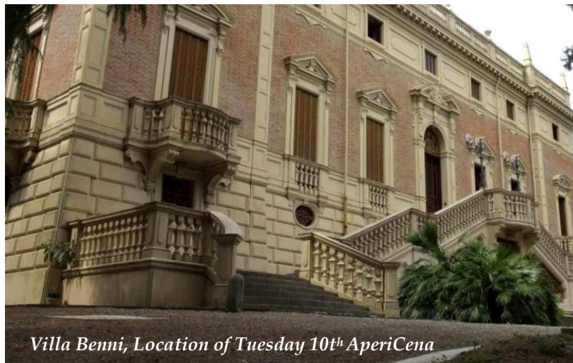
Villa Benni, Location of Tuesday 10 th AperiCena

Explore the Meeting themes in our website .